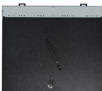
410. Till Cover w/ Lock & Cover Key