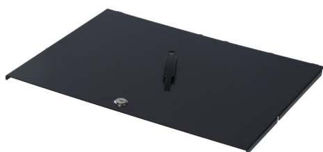
410. Till Cover