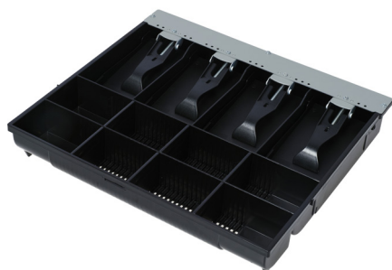
4Bill+8Coin Till w/ Plastic Holder (Fixed & Removable Tills Are Available)

Durable tills equipped with strong dividers, easy-to-use holddown grippers, and till cover options