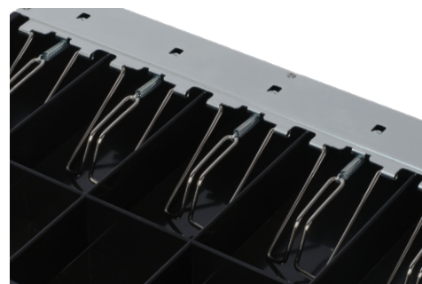
Metal & Wire Holders Are Available As Options