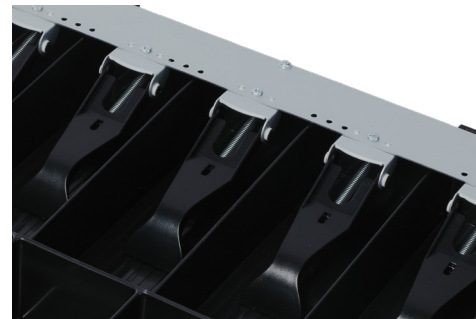
Bill Holddown Grippers (Mainly Plastic Bill Holder)