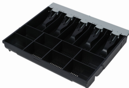
5Bill+8Coin Till w/ Plastic Holder (Fixed & Removable Tills Are Available)