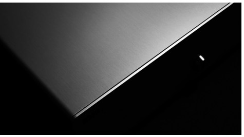
{\tt BSM\ BUMIL\_NEW\ CACH\ DRAWERS\ [ALUM.SERIES]\ Black\ Aluminum\ and\ Dark\ Gray\ Aluminum\ Cash\ Drawer}